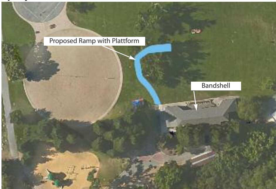
Simulation of proposed asphalt path to be installed at Moraga Commons Park

On Feb. 25 the Town Council approved the construction of an asphalt path at the Moraga Commons Park to provide disabled residents and children in strollers access to the popular venue. The path will meander slightly from the band shell area toward the trees, going up the hill at a gentle slope (4.5 percent) and ending on a landing pad.